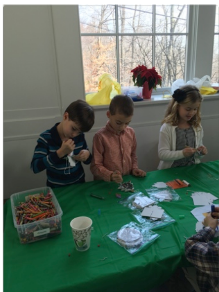
Kids having fun creating seasonal crafts