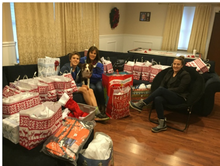
Some of the bags of donations, for the residents at Somerset Home, ready to be delivered